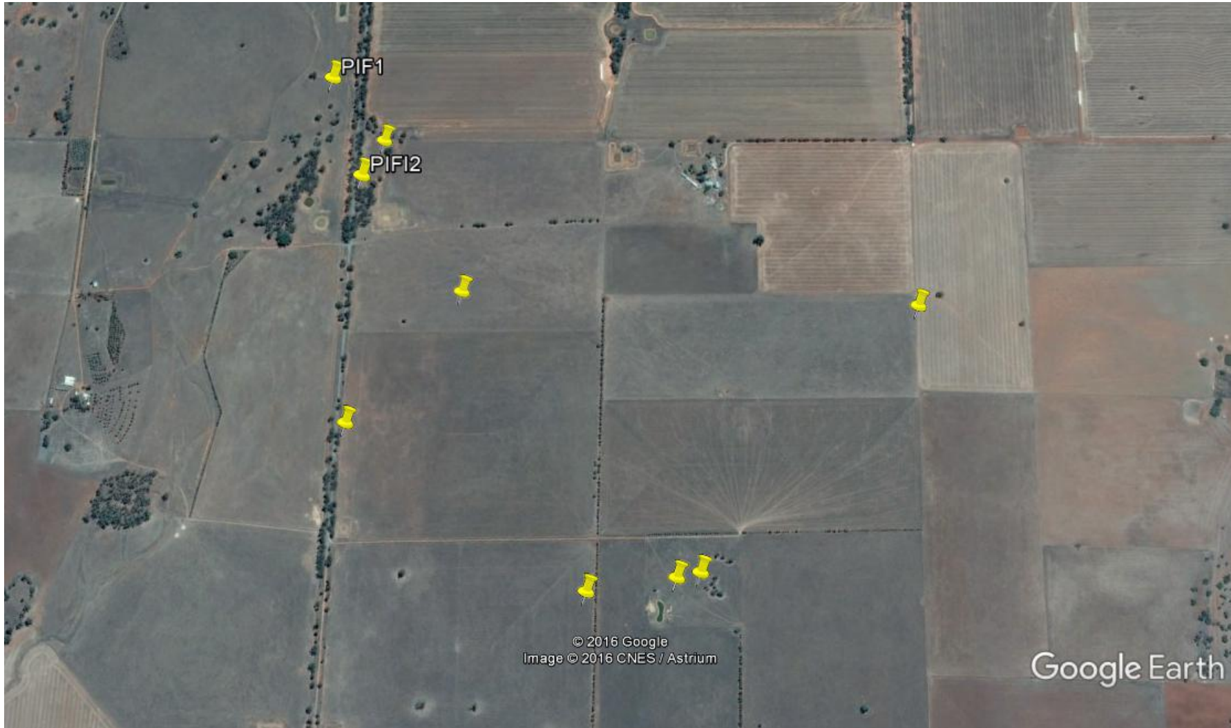
Figure 1: Heritage sites – Parkes (Refer to Figure 2 for reference to proposed site)